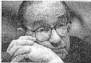
1994: Fed Chairman Alan Greenspan surprises markets with a rate hike