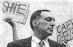
2008: Financial crisis overwhelms Lehman Brothers; CEO Richard Fuld