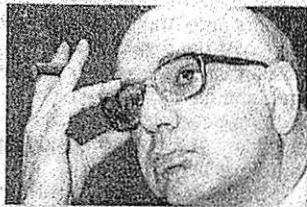
1981: Fed Chairman Paul Volcker ratchets up rates to fight inflation

The Big Round Trip | Yield on the 10-year Treasury note